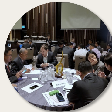
ASEAN SMART CITY NETWORK