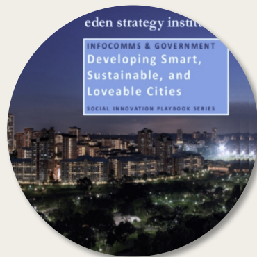
SMART CITIES PLAYBOOK