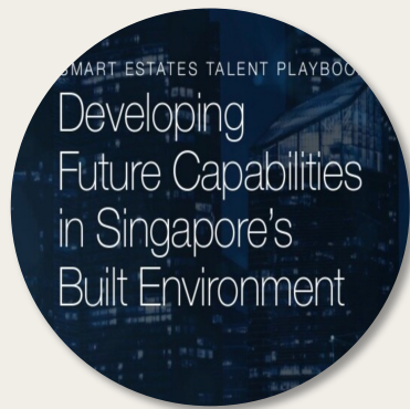
SMART ESTATES TALENT DEVELOPMENT PROGRAMME

We seek to catalyse Smart Cities that are more inclusive, sustainable, and loveable