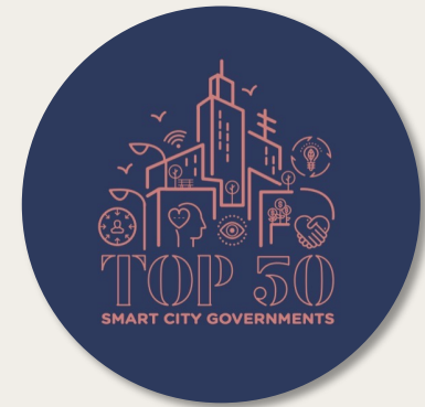
TOP 50 SMART CITY RANKINGS REPORT

Learn more about our work at www.edenstrategyinstitute.com