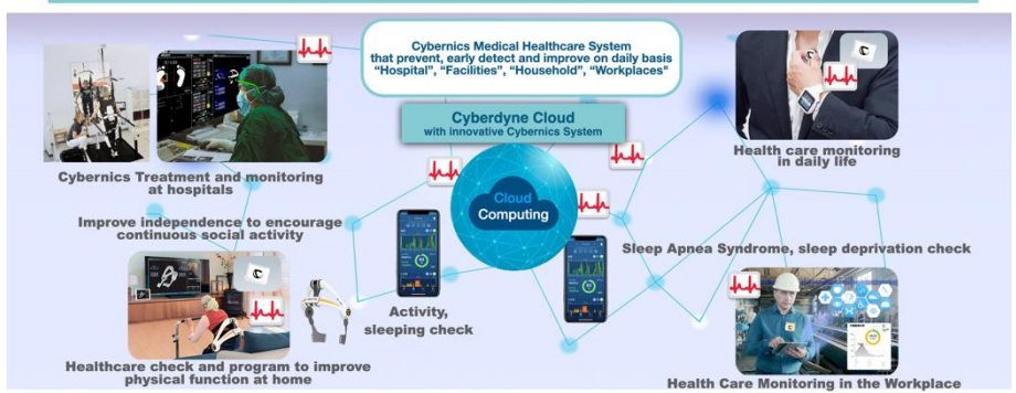
Seamless data linkage between hospitals, facilities, homes, and workplaces with IoH/IoT