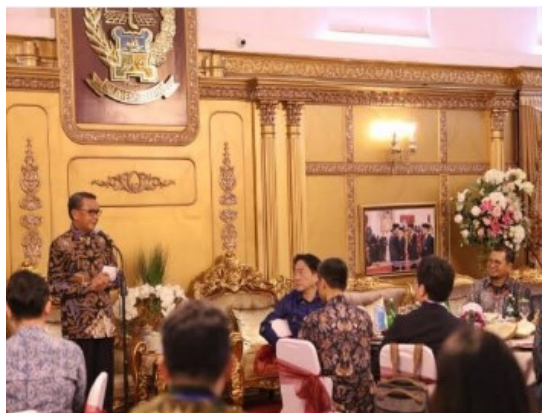
Reception at the Governor's Official Residence