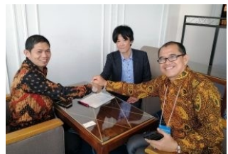
Meeting Minutes with a member of JASCA (Transport and Health Sector)