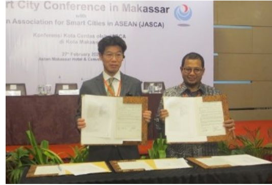
Signed Record of Discussion