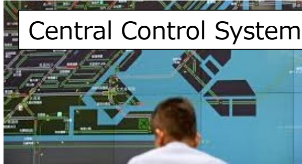
Central Control System