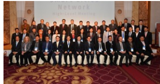
1 st HLM @ Yokohama