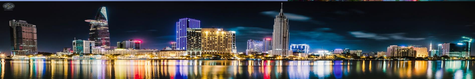
Ho Chi Minh city