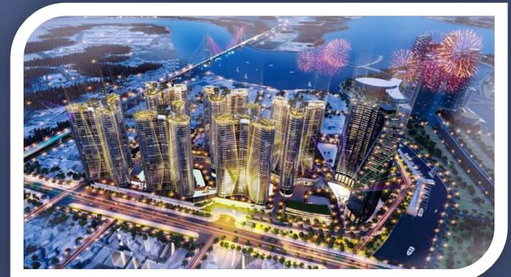
Sunshine diamond river city - HCM