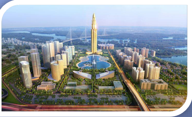
BRG-Sumitomo smart city - Hanoi