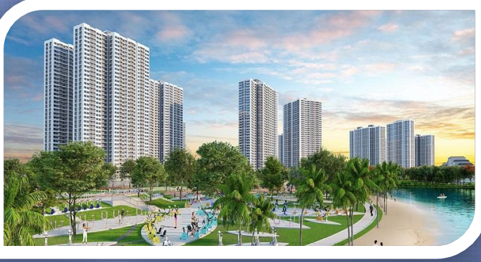
Vinhomes smart city - Hanoi