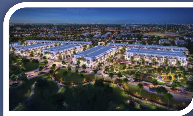
Thanh Do smart city - Can Tho