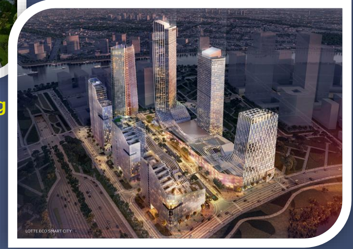
Lotte eco-smart city - HCM