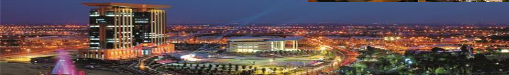
Binh Duong city