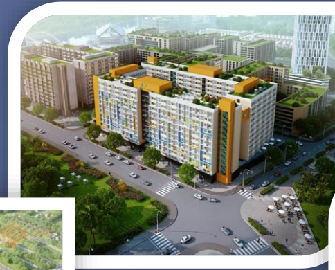
FPT city - Danang