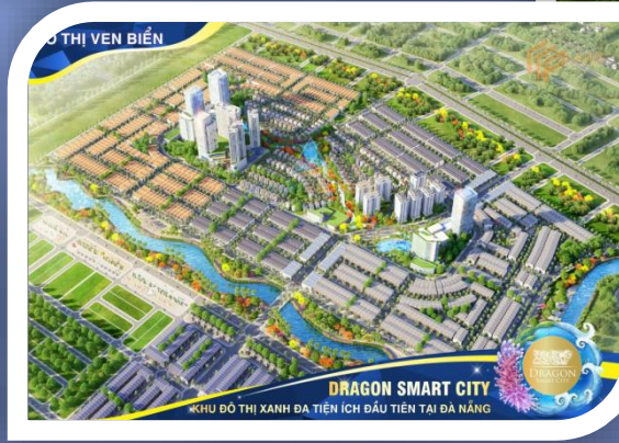
Dragon smart city - Danang